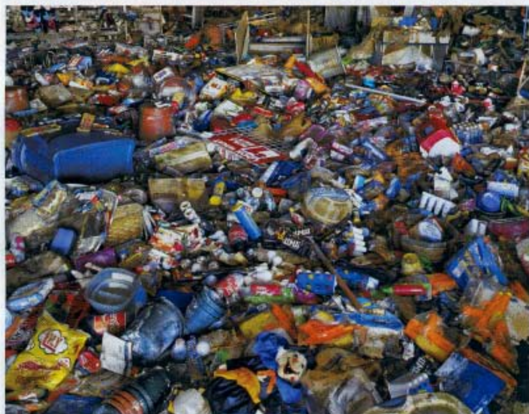
Opposite page: "Untitled (Tree Limbs)," "Untitled (Sock Drawer)" This page: "Untitled (Refrigerator Door)," "Untitled (Dollar Store)"