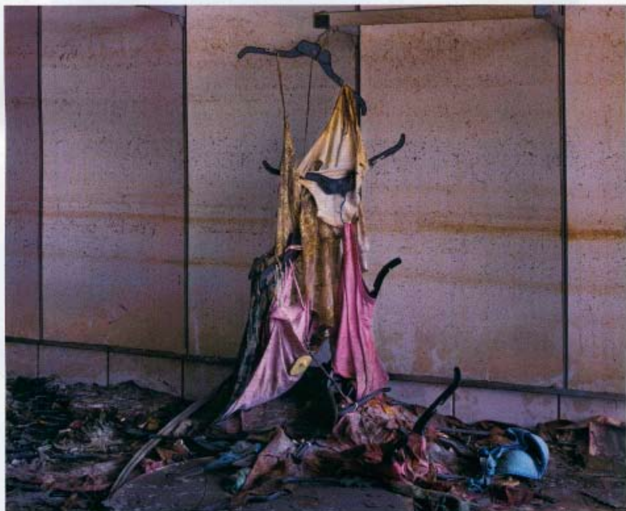
"Untitled (Clothing Store)"